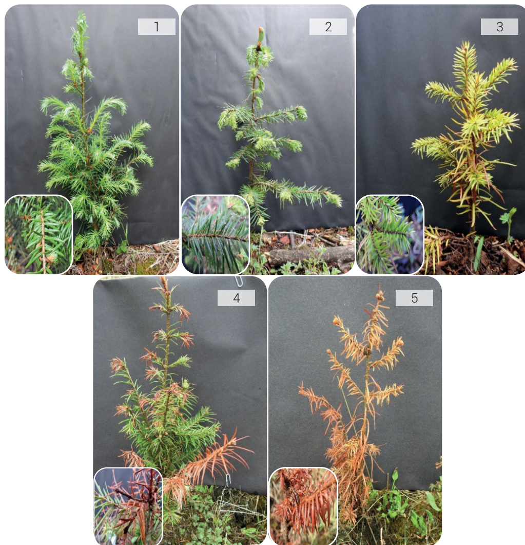
Figure 1. Representation of the five levels of the stress index for Abies religiosa seedlings. Numbers in the figure indicate the different levels of the stress index; level 1: healthiest condition; level 2: plants begin to exhibit slightly circular discolorations (of yellowish tones) in 80 % of the leaves; level 3: the plant leaves change to a greenish yellow tone; level 4: between 40 and 50 % of the leaves are yellow, and between 50 and 60 % are brown; level 5: 98 % of the foliage is reddish brown (see materials and methods for further description).